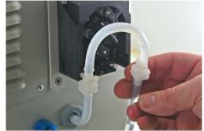
Step 3 Once tube is clear of pump head, you will now be able to replace the pump tube.