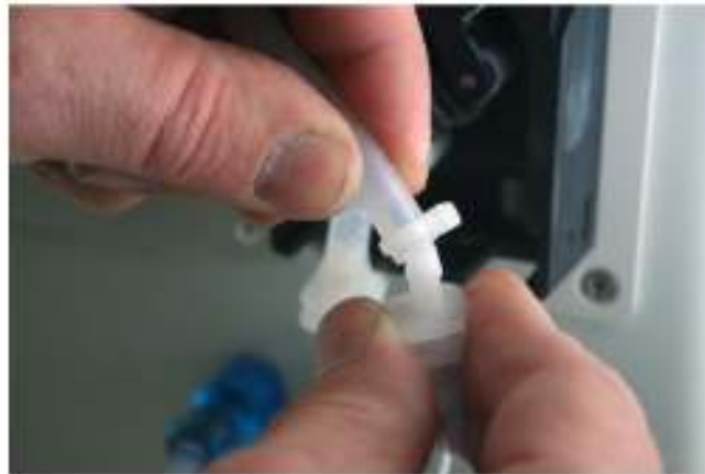
Step 5 Fit new pump tube and adjust ties.