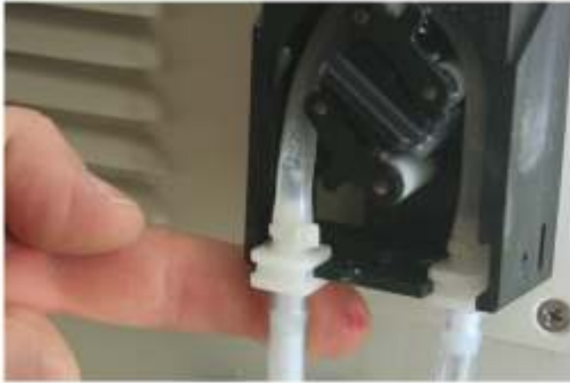
Step 1 Pull left side of tube out of housing.