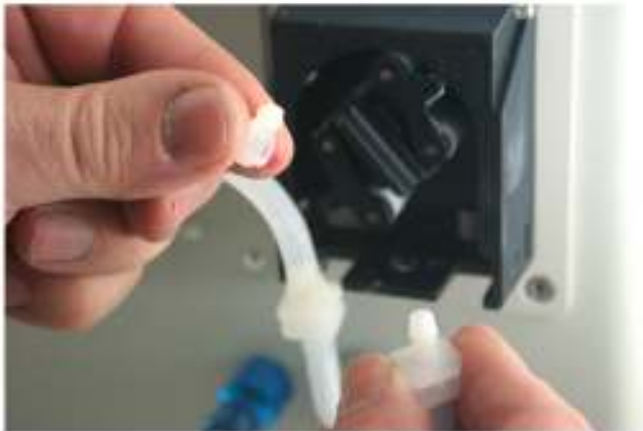
Step 4 Remove the old tube.