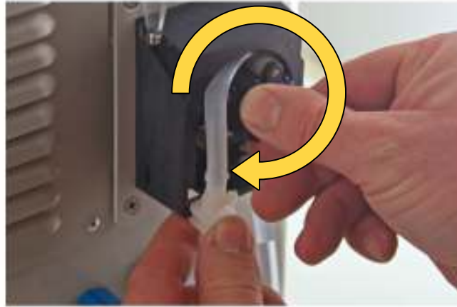
Step 2 While rotating clockwise, pull tube towards you.